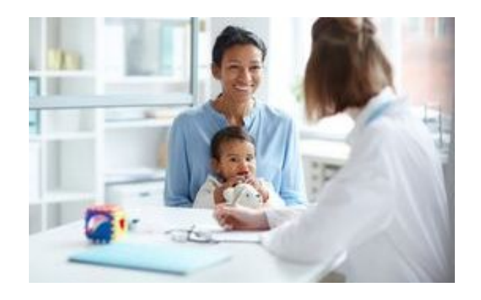
<u>Pathology and patients at the 75th</u> <u>anniversary of the NHS</u>