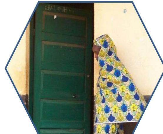
Gender Based Violence