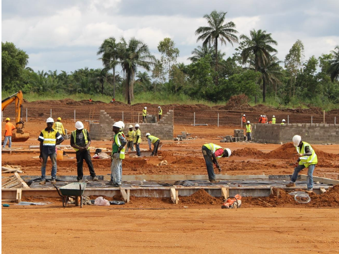
Construction of ETC, SL...