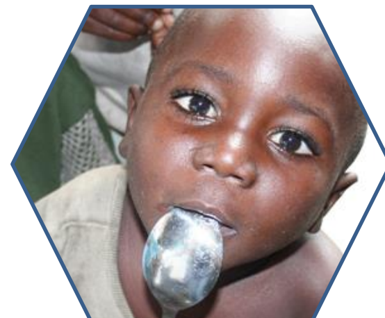
Nutrition & Food Security