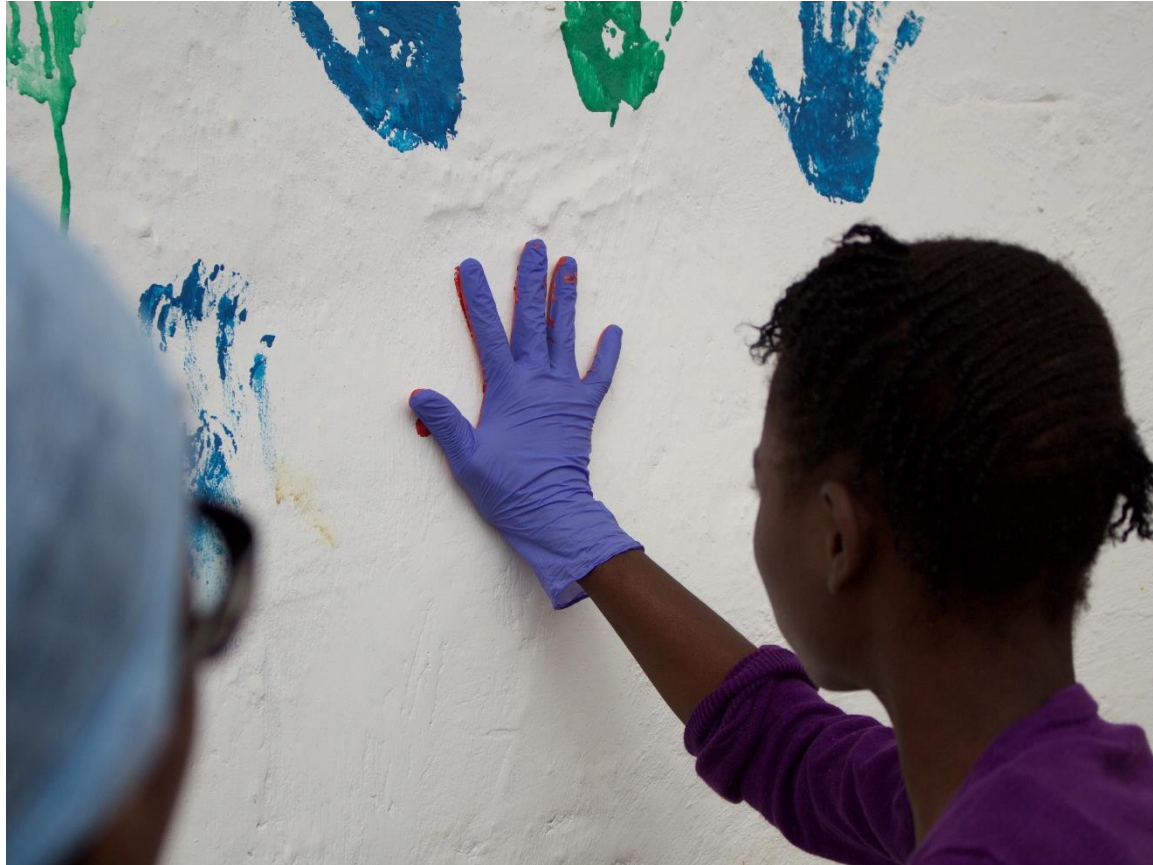
Survival Wall, SL