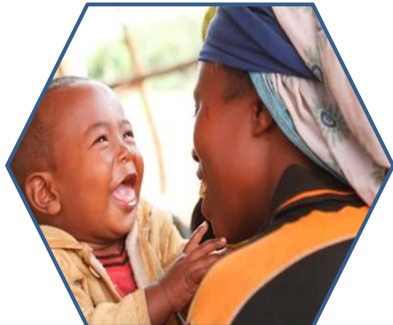
Mother & Child Health