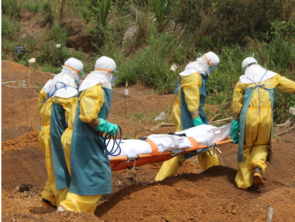
Response, Burial Teams, SL