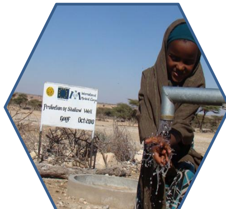
Water, Sanitation &