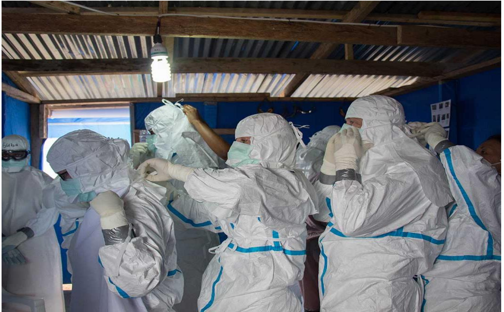
Ebola response, Liberia