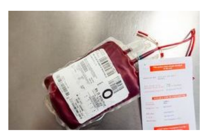
Sex and gender disparities in access and outcomes in kidney transplantation