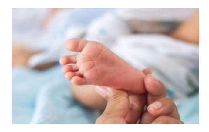
<u>A bump in the road – addressing</u> <u>preventable errors to ensure safe</u> <u>transfusions in maternity</u>