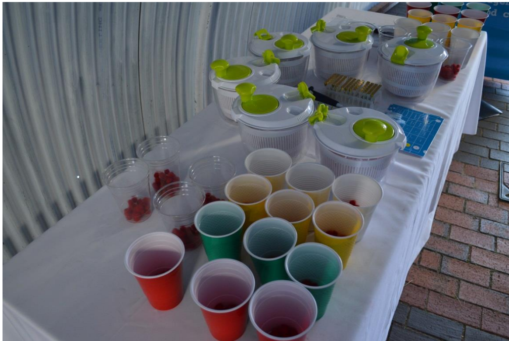
Example of a setup of crossmatching activity (extra large set).

Distribute the pom poms between all of the cups so there is a handful in each cup. Set out each coloured cup with the salad spinners, positioning the clear cups slightly separately from the coloured ones. Display the cards and pipettes.