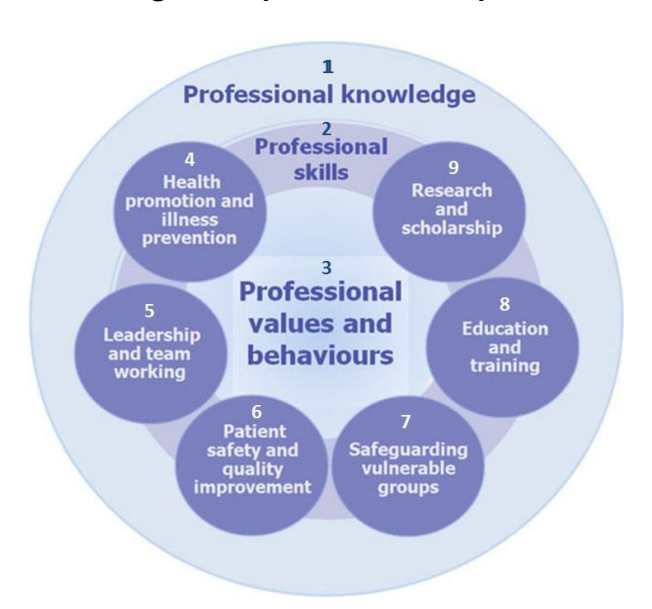
Figure 2: The nine domains of generic professional capabilities

The GMC has developed the GPC framework with the Academy of Medical Royal Colleges (AoMRC) to describe the fundamental, career-long, generic capabilities required of every doctor. The framework describes the requirement to develop and maintain key professional values and behaviours, knowledge and skills, using a common language. GPCs also represent a system-wide, regulatory response to the most common contemporary concerns about patient safety and fitness to practise within the medical profession. The framework will be relevant at all stages of medical education, training and practice.