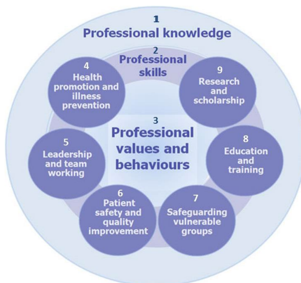
Figure 2: The nine domains of generic professional capabilities

Good medical practice (GMP) is embedded at the heart of the GPC framework. In describing the principles, duties and responsibilities of doctors, the GPC framework articulates GMP as a series of achievable educational outcomes which will inform curriculum design and assessment.